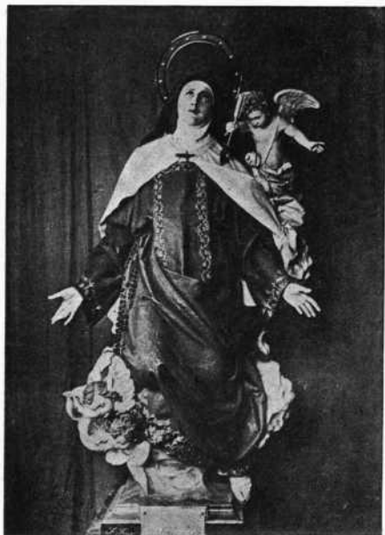
The Transpiercing of Saint Teresa's Heart