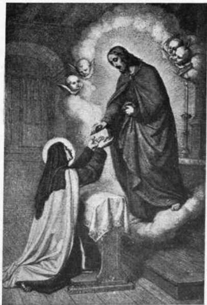
The Mystic Espousals of St. Teresa of Jesus