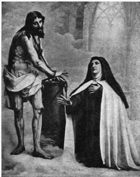
St. Teresa's Vision of the Scourging