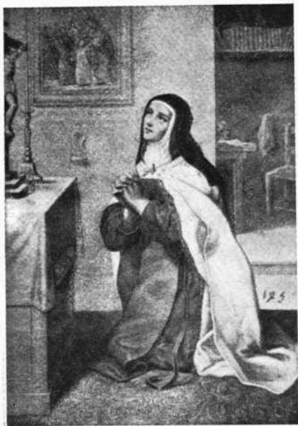
Our Lord bestows upon St. Teresa the Sufferings of His Passion