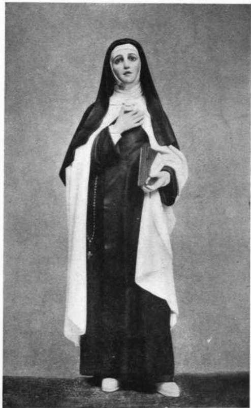
Saint Teresa of Jesus