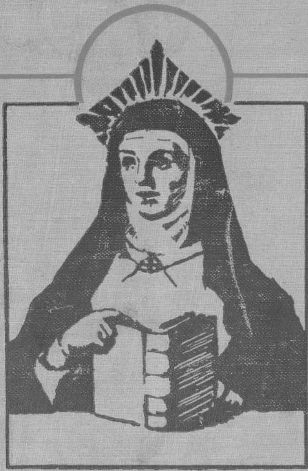
St. Teresa's Own Words