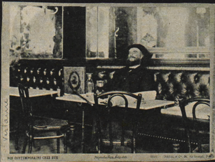
A Dornac studio portrait of the tragic French poet Paul Verlaine. "After Daguerre: Masterworks of French Photography (1848-1900) from the Bibliothèque Nationale," at the Metropolitan Museum, Dec. 18 to Feb. 15.